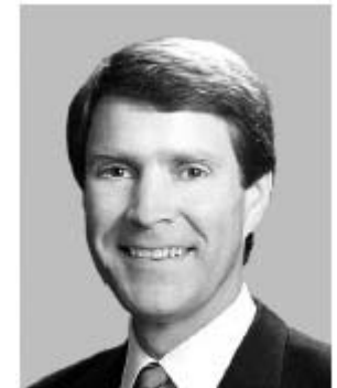
Sen. Bill Frist