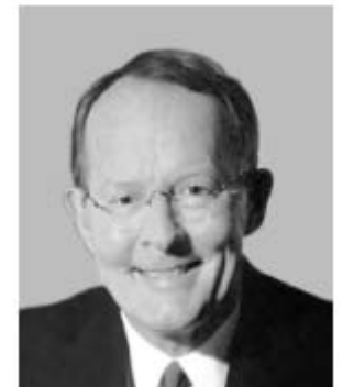
Sen. Lamar Alexander